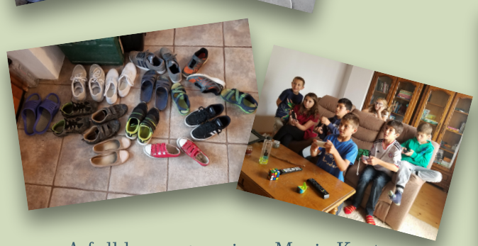
A full house + serious Mario Kart competition = just a normal day, haha.