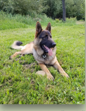
Our guard dog "Jack"