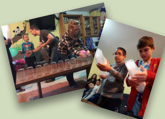
"Minute to Win It"