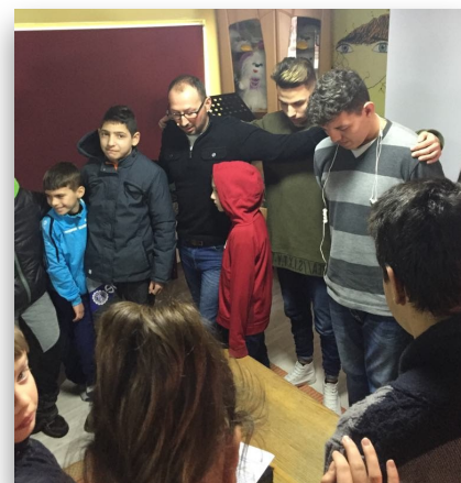
Sending out our "A Future & a Hope" graduate with prayer

"Open wide your hand to your brother, to the needy and to the poor, in your land."